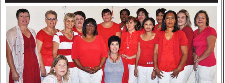
AMAGQIYAZANA ASEBENZA KWISEBE LASE GANSBAAI BEHOMBELE USUKU LWEZITHANDANI.